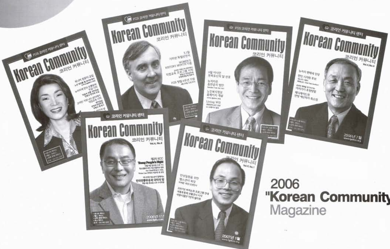
2006 "Korean Community" Magazine