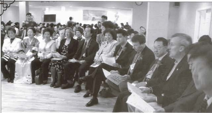
The 6th Anniversary Celebration on April 29 - Awards Presentation